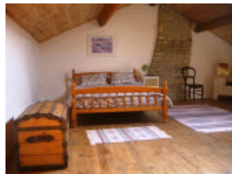
The Stencil bedroom