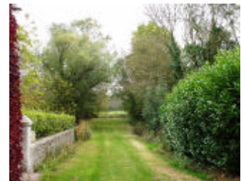
Lane way, river 100m