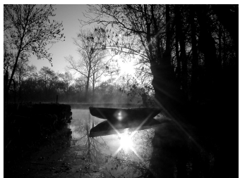
Sunrise from River