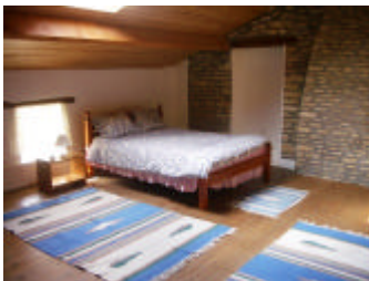
The pine bedroom